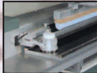
Closed cup system

■ Precision engineered for superior quality printing