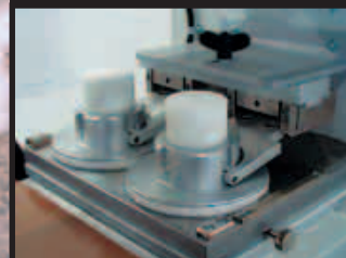
Closed cup system